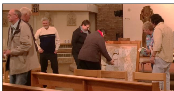
3am Prayer at Bedlington: praying for the local area – with people from different parishes putting their pieces of a jigsaw together.

As part of Forward Together in Hope we are promoting the idea of 24 hours of prayer. The Spirituality Team have produced a very useful leaflet – setting out some key information on how you might go about arranging and co-ordinating one. This is entitled One Night, One Day and is available from the resources section of the website.